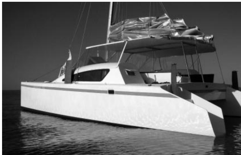
Gunboat anchored at the beach