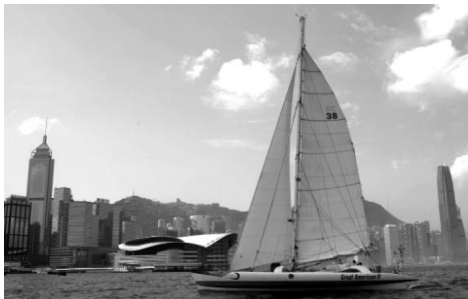
Great American II leaving Hong Kong Harbor