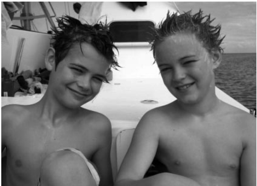
Boys wash their crazy hair