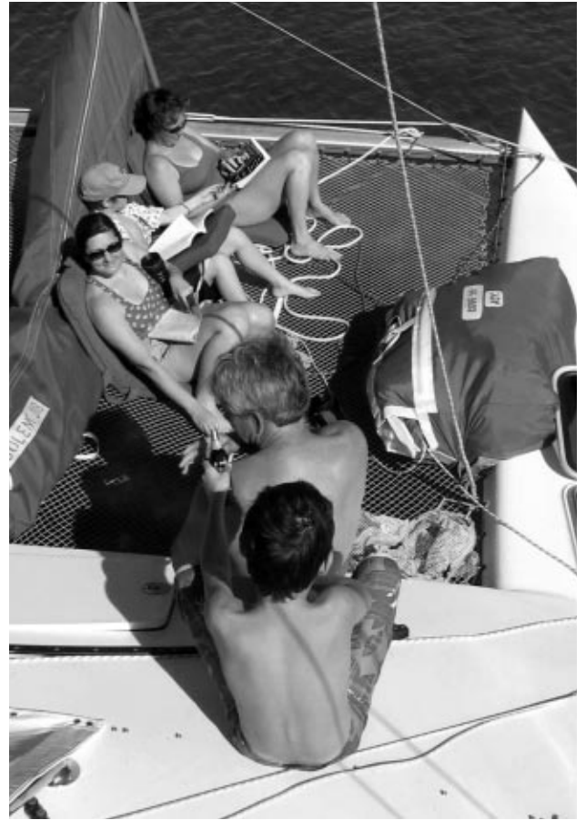
Relaxing on the nets